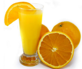
Fresh Orange Juice