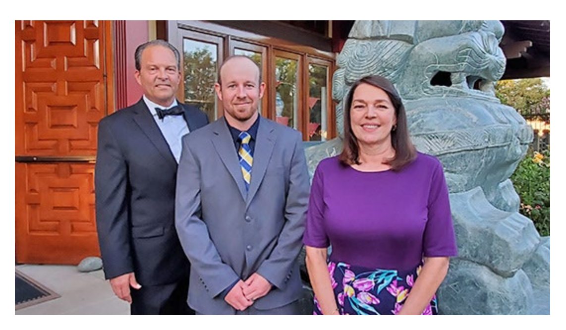
Last week, TCOE and the Central California Chinese Cultural Center honored three extraordinary teachers at the 26th Annual Confucius' Birthday/Educators of the Year Awards.