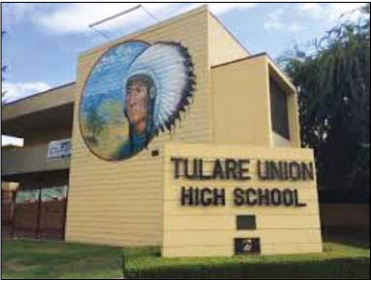
Redskin mural on high school wall

required public Schools in California to drop the use of the word Redskin as a team name or mascot by January 2017. Tulare Union High School is one of three schools in the central valley that has to make this change. Tulare Union has been given more time to change things such as athletic uniforms but, the school will have to take down and change anything that uses the word “Redskin”. Also, if the new mascot is not Native American, all images will have to be changed too. Tulare Union recently reached out to the community for help in choosing a new mascot. Students, school staff, and people from the community could vote for a new name online.