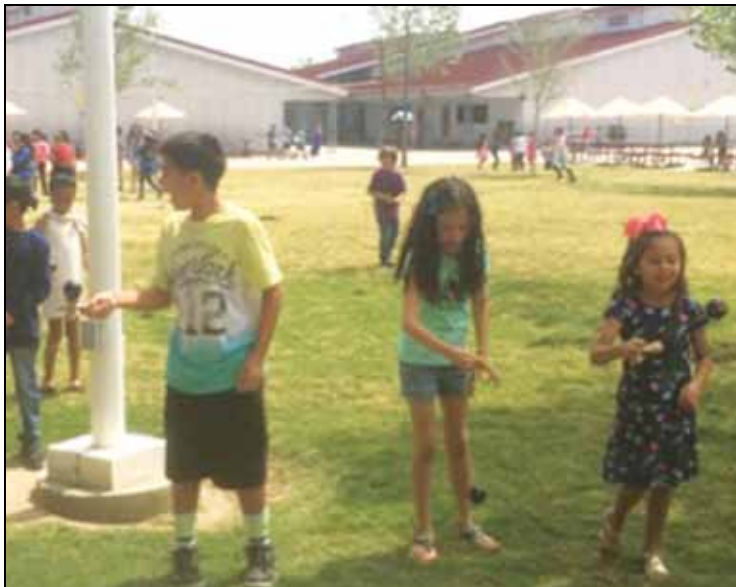
Students at Heritage play with Kendamas at recess.

perform the intended trick correctly. Furthermore, a benefit of Kendama tricks is that it can strengthen hand and eye coordination as well as help with balance and reflex skills. A Kendama is a remarkable toy that has a variety of benefits. If you are lucky enough to have one, you might want to search the internet to view some cool moves that you could learn and impress your friends at school or home.