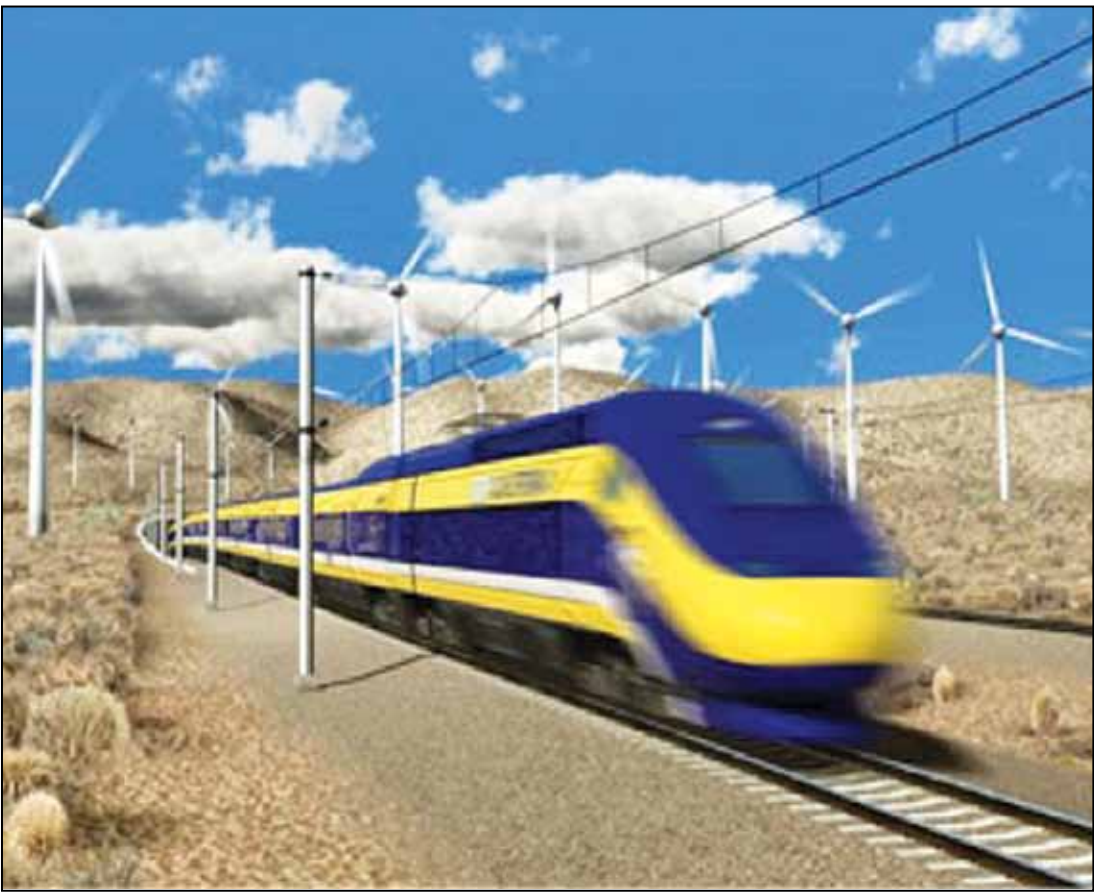
Rendering of the high-speed train, expected to travel at 220 miles per hour between Sacramento, San Francisco, Los Angeles, and San Diego.