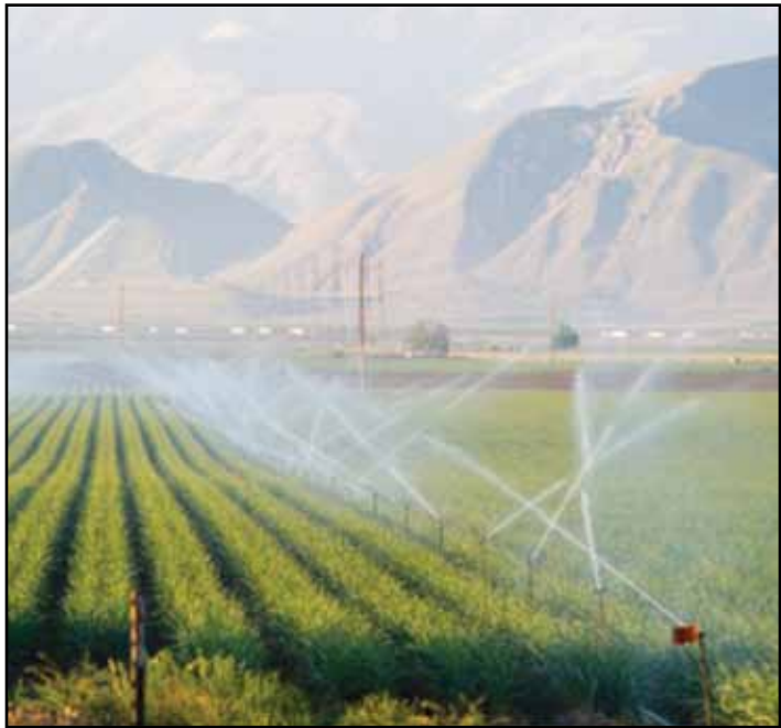
A wheat field near Bakersfield, Calif., March 2015.

rail. Then in 2012, Governor Edmund G. Brown Jr. made the high-speed rail a priority for his Administration. Also, in 2012 the High-Speed Rail Authority adopted a business plan for implementing the high-speed rail. California can use a plan for water. Agriculture requires water. Big agriculture, like in our Central Valley, uses large amounts of water. A long time ago, a hundred years, there was a lot of water in California Now, according to the New York Times, “The depletion of groundwater