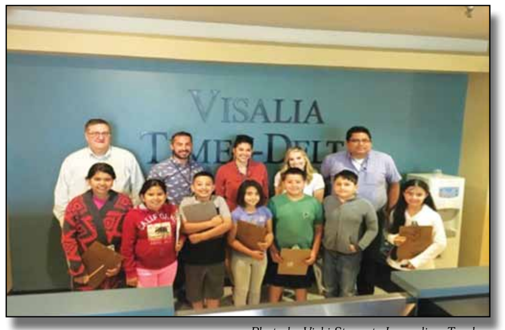
Our Journalism team and the five VTD employees we interviewed.