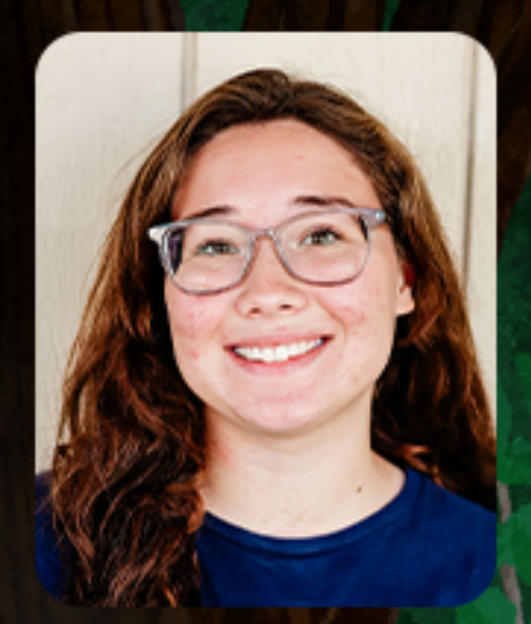
11th grade Redwood HS