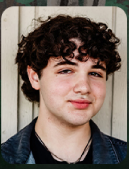
9th grade University Prep HS