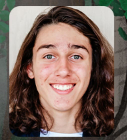
9th grade Redwood HS